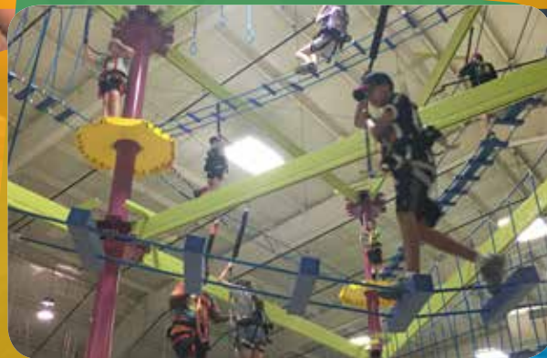
Our SkyTrail Explorer®

The LIT program teaches participants leadership skills. Activities include assisting camp groups and facilitating camp activities under the direction of senior camp staff. Emphasis on teambuilding exercises and includes both classroom-style and experiential learning. LIT's will learn the skills necessary to become leaders at camp, at school and in their community.