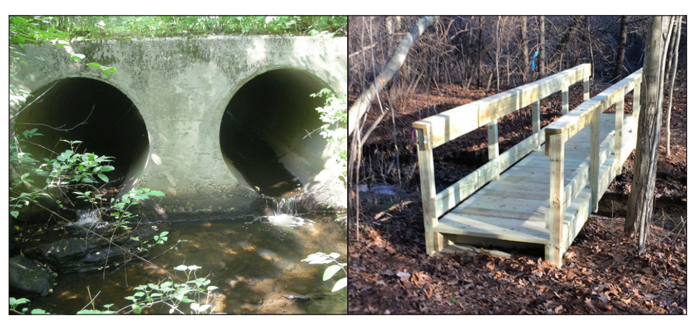
This culvert on the Iron Mine Brook blocked fish from accessing colder water. The culvert was removed and a footbridge was built in a great team effort.

The next step is restoring fish passage to the upper reservoir by raising the reservoir by 1.5 ft. This will make the town's water supply more drought resilient by allowing an additional 28 days of storage, upgrading the dam infrastructure to meet new flood prevention criteria and enabling a working fish ladder to pass river herring in and out of the reservoir. Just recently the town, with support from NSRWA, applied for state funding that would pay $1.23 million dollars of the estimated $1.86 million dollars needed to complete the project. A triple win situation for the town's water supply, the ratepayers, and for the fish!