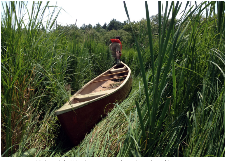
High and dry! Hauling canoes where there should be water.