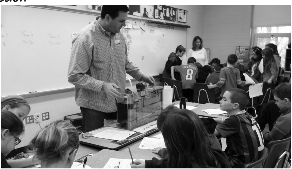
Students and parents learn about groundwater in our Water All Around You program in Hingham.

We have steadily expanded the number and variety of our scenic and historic walks and paddles, and in 2012 we initiated a "River Science Exploration Fridays" - formerly known as "Science Fridays in the Shed." Targeted to kids and families, this has been oversubscribed from the start.