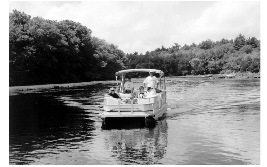
Take a tour with us on the North River this summer! See page 11.