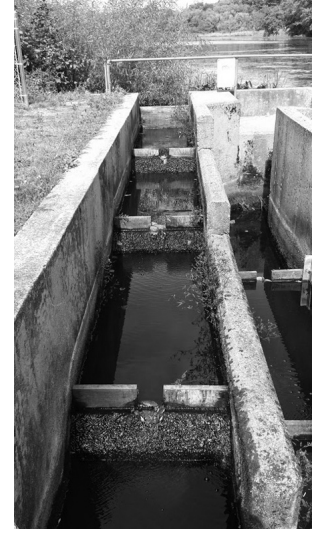
Old Oaken Bucket Fish Ladder

While continued efforts are needed to conserve water in the system, the last infrastructure work required to allow herring to return to the upper Reservoir and increase the drought resiliency of the town's water supply is raising of the reservoir by 1.5 ft. We were extremely pleased that last fall, along with the South River funds noted above, the Environmental Bond Bill also authorized $1.3 million for this work in Scituate.