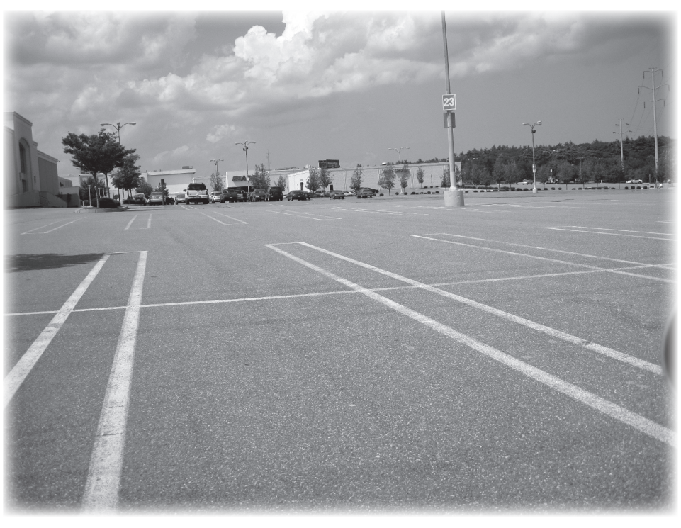
Hanover Mall parking lot.

Over many years, NSRWA and others have done a good job of protecting the main stem of the rivers. But hidden in the upper watershed, the tributary streams that feed the rivers are being impacted by increasing impervious surfaces. These cause pollution miles downstream, closing beaches and shellfish beds.