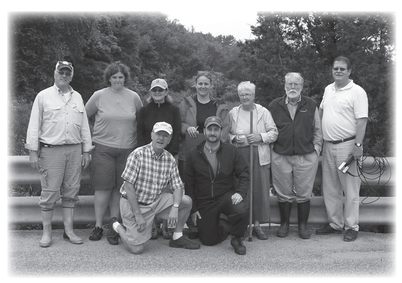
A "sampling" of River Watch 2009 volunteers.

he NSRWA's 15th Annual River Watch Water Quality Sampling Program had a great season with a dedicated group of volunteers. The program has been able to continue over the years partly due to a generous gift from an anonymous donor.