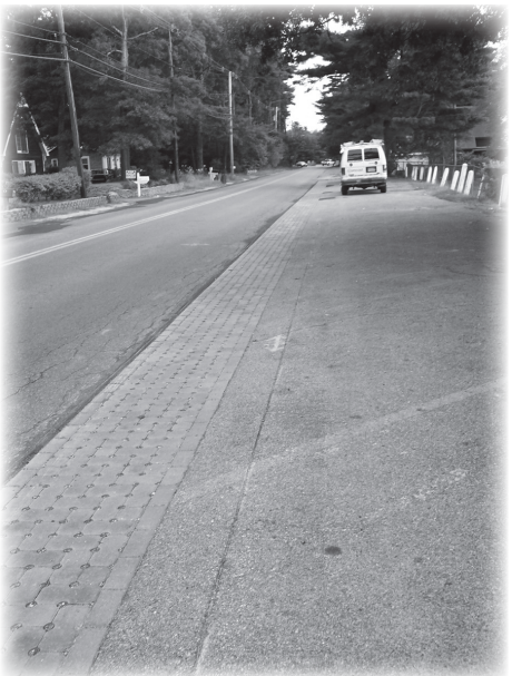
Permeable pavers on Washington Street in Pembroke

drought-tolerant plants. Their purpose is both filtration (physically by the soil particles and biologically by the plants and natural soil bacteria) and infiltration (as the water percolates into the groundwater.) There are raingardens at the corners of the Pembroke Town Hall and along the Town Police station that capture, treat and recharge roof runoff while also beautifying these public spaces.