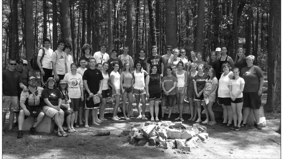
Hanover High School's AP Chemistry class at Couch Beach during a class field trip on the North River with NSRWA.

“After all, I believe that it is extremely important to protect natural resources like the North River because it is the home to many plants and animals that are key in the chain of survival for many species...[including] ourselves.”