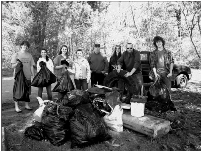
Hanover volunteers display the trash they picked out of the river!

Over 100 adults, students, and families with children came out on a glorious day to rid the rivers, tributaries and surrounding areas of trash. All told we picked up more than 20 pick up truck loads of trash and prevented this waste from entering our waterways and ocean.