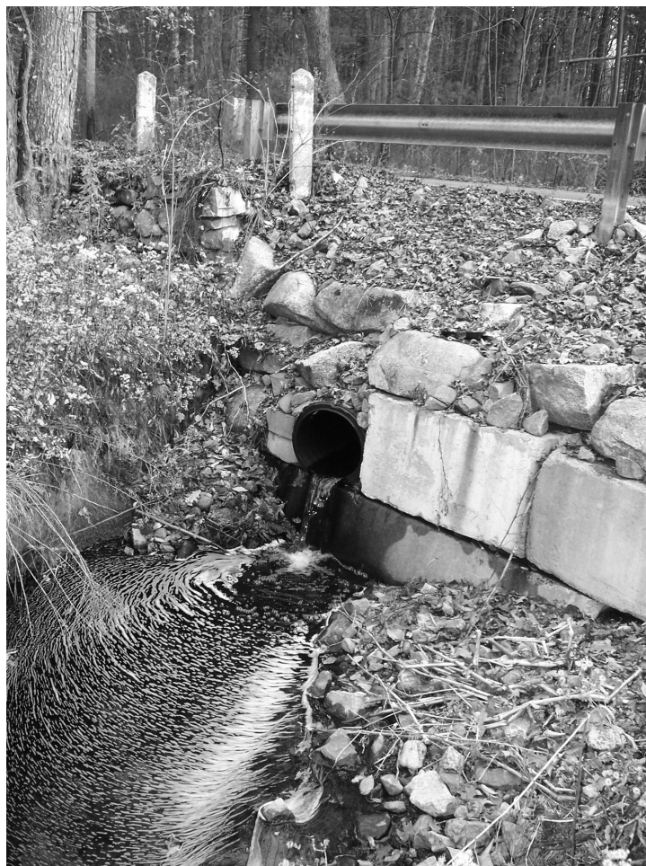
Culvert in Furnace Brook, Marshfield - an example of a perched culvert impeding flow and fish passage.

The NSRWA's Blue Communities campaign seeks to restore natural flows to the North and South Rivers. Whether by recharging water into the ground through smart stormwater management and land protection, by reducing our water consumption, or by reconnecting streams that have been altered by physical impediments like dams and culverts our goal is to recreate or mimic the natural processes that have been lost.