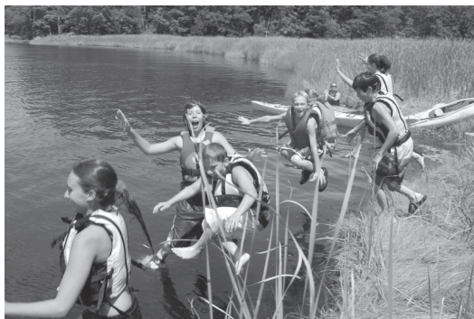
River campers enjoying a swim!

• Lastly, we have entered the schools in our watershed and beyond with our Water All Around You program. Geared towards 5th grade, this program educated 1,575 kids in 10 schools about their local water resources in 2010, with the goal of teaching them to be future stewards of their local waters. This year we will do at least that much again: our ultimate goal is to reach every 5th grader within our watershed every year.