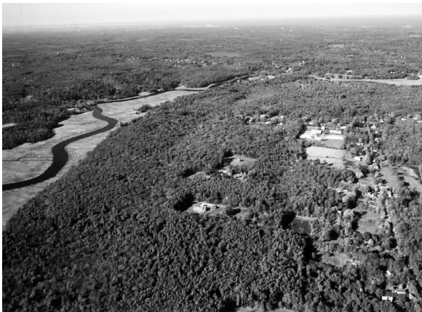
Aerial of North River with recently protected Goggin Parcel on right.

In 2005 the NSRWA charted what we wanted to accomplish through 2010 for protecting land, advancing education on river stewardship and restoring water quality and habitat. 2010 saw the culmination of many of our collective efforts - thank you! As we embark upon our next strategic planning effort, we thought it would be useful to look back at what has been accomplished over the last decade.