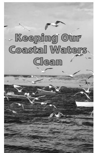
Brochure developed by the NSRWA to educate boaters on the No Discharge Area