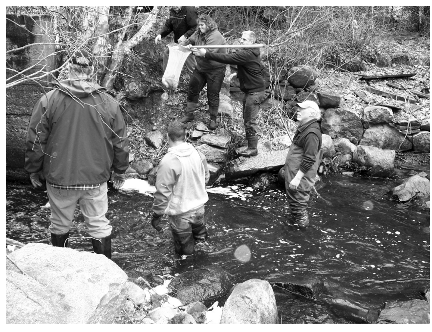
Above: NSRWA volunteers heeded our call to help the herring make it over a broken fish ladder in Pembroke on the Herring Brook. Over 18,000 fish were moved by these intrepid volunteers to their natal spawning grounds up at Oldham Pond.

At right: We hosted a flyfishing demonstration up at the Indian Head River and we took out 30 people to the North River clam flats to show them how to dig for their own shellfish. We hope to do these events annually!