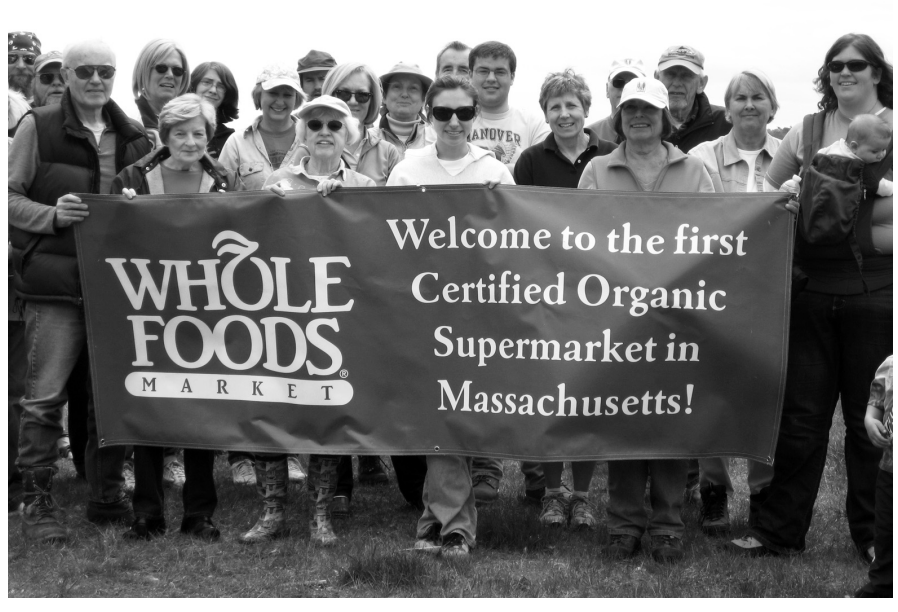
Thank you to Whole Foods for not only sponsoring our Clean Up Day but for making us the recipient of their 5% Day this year which provided $4,758 to our 5th grade Water Education program! And a big thank you to all the volunteers who got out and cleaned the river banks with us.

This past spring was a busy one for the NSRWA!