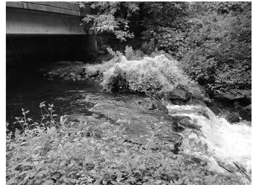
A severe barrier in a system with otherwise good habitat (Cross St. on Indian Head River, Hanover).

This project was funded through the Massachusetts Bays program and represents a huge volunteer effort – more than 750 hours of volunteer time was provided in the field surveys and data gathering for this report. We will be presenting the findings of this report at our Annual Meeting on November 4th at the South Shore Natural Science Center and honoring the work of the many volunteers who contributed to this effort. Please come and find out more!