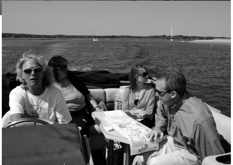
EPA River Tour – Above photo of the Spit.