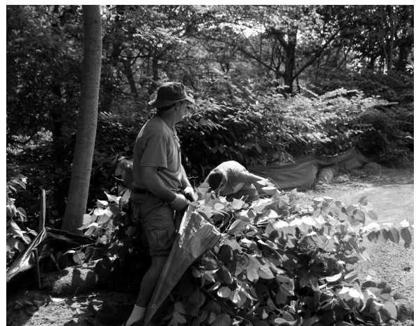
Volunteers removing the invasive Japanese Knotweed from the South River Park.