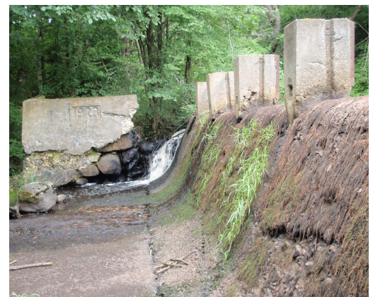
Cardinal Cushing dam at Tack Factory Pond showing deterioration of the right abutment to the spillway.