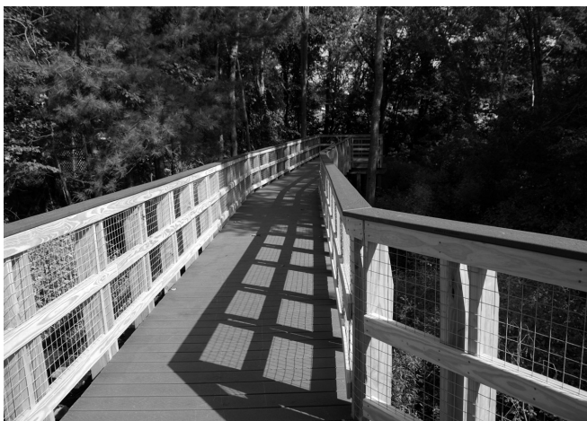
The new South River Boardwalk at the South River Park.

In addition, the NSRWA secured a $10,000 donation from the Sheehan Family Foundation for the boardwalk and for removal and control of Japanese Knotweed – an invasive plant that covers the banks of the river at this site. In order to remove the invasive Knotweed we are working with Kyle Grable, Marshfield Boy Scout from Troop 101. We still need volunteers to help as this is a long term management project! If interested please contact our office at 781-659-8168 or Samantha@nsrwa.org