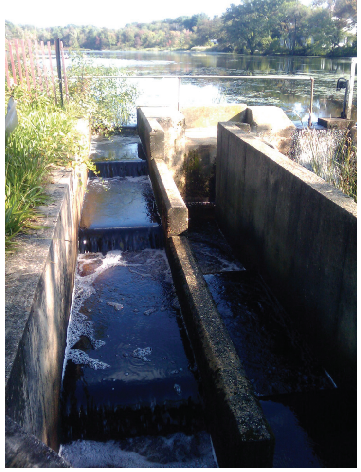
YMCA Mill Pond dam breach.