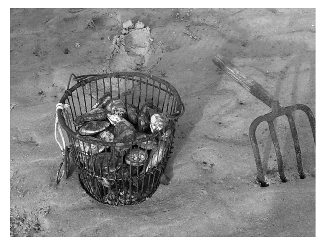
Clams harvested from the South River.

During 2013, our goals are to seek an intern to complete an assessment of the North and South Rivers estuaries for potential sites for restoration of shellfish reef habitat (oysters and mussels) and the feasibility of growing shellfish suspended in the water column for the purpose of filtering and reducing pollution in the water column. Part of the intern's work would investigate how and if the laws that govern the propogation of shellfish in Massachusetts could be met in order to implement such a project.