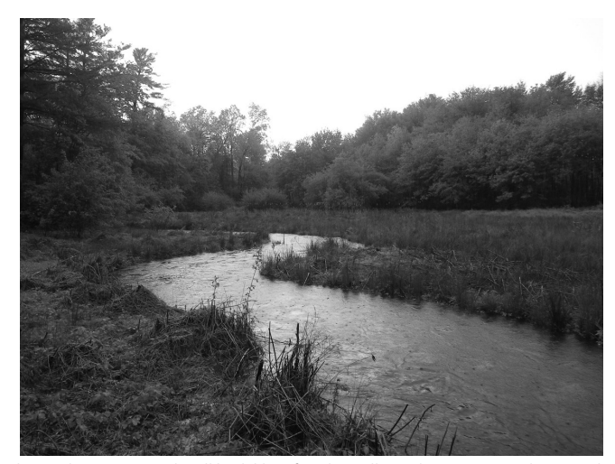
What 3rd Herring Brook will look like after the Mill Pond Dam removal is complete.

As we go to press, the dam downstream of Mill Pond dam at Tack Factory Pond on the Third Herring Brook owned the Cardinal Cushing Centers is also under discussion for removal. The Cardinal Cushing Centers is hosting an informational meeting on April 3, to provide information on the condition of their dam to the public, abutters to the Tack Factory pond, legislators and others. The NSRWA has engaged state and federal agency technical and financial support to help the Cardinal Cushing Centers with this process. The NSRWA and its partners continue to seek funding for Cardinal Cushing Centers to conduct the design, permitting and engineering phases. To date we have leveraged $40,000 towards those next steps.