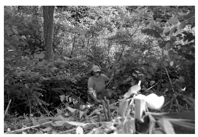
Removing Japanese Knotweed in South River Park.

• The Associations hopes that someday a Third Herring Brook Trail will connect the NSRWA office with the YMCA and the South Shore Natural Science. Our goals for 2013 are to begin discussions with stakeholders, and if the Hanover Mall (which owns critical property) is willing, to seek funding for a pedestrian bridge over the brook. Clearing the trail path itself, if the brook crossing is achieved, could be done as a volunteer project cooperatively with the YMCA and the Science Center.