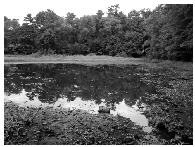
Mill Pond Impoundment in August 2012 - after dam partially breaches.

The hearings that began in February are critical steps in the dam removal process. The Conservation Commissions are required by state and local law to assure that any "alteration" of a wetland is conducted in a way that will protect various specific wetland values, and removing a dam, of course, alters the wetlands at its location.