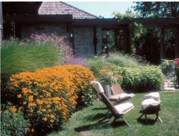
A beautiful and functional Greenscape with low-maintenance plants full of color and interest framing the lawn's recreational area.

By spending 5% of the value of your home on the installation of a quality low-maintenance landscape, you can boost the resale value of your property by 15%, earning back 150% or more of your landscape investment (source: Smart Money)