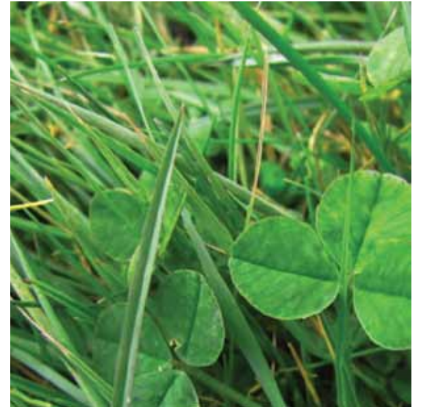
Clover adds nitrogen to your soil

Dutch white clover is a beautiful low-growing, broadleaf species that used to be a welcome addition to many lawns. This hardy perennial smothers weeds, prevents erosion, retains moisture and naturally "fixes" nitrogen in your soil. Clover is tough enough to withstand foot traffic and offers beautiful dark green foliage and small white flowers. If bees are a concern to your family, control the blooms with frequent mowing.