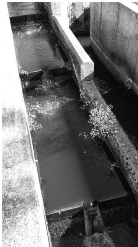
Above: Old Oaken Bucket Pond fish ladder with streamflow release on 9/12/14 to allow herring fry to return to ocean and to maintain stream habitat downstream of the dam.