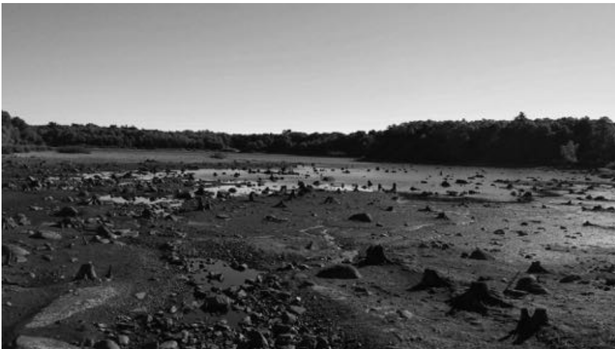
Scituate Reservoir photo taken 9/12/14 with moderate drought conditions. If the spillway can be raised and the ladder modified this condition will be lessened providing more water supply capacity to the town to withstand droughts and the herring will be able to use the fish ladder in the fall to return to the ocean.