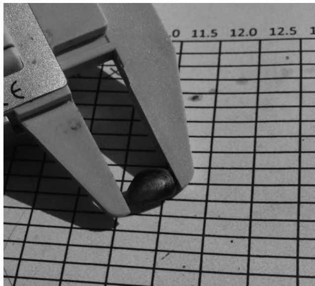
Measuring mussel spat.