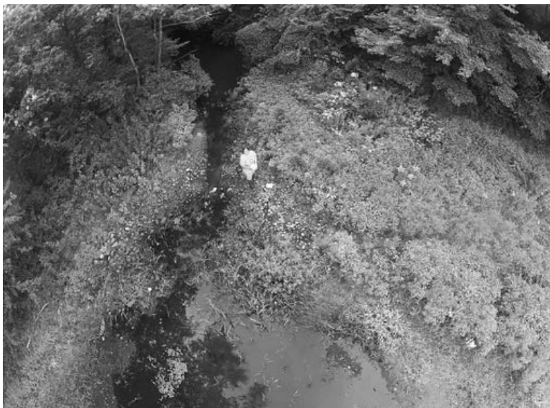
Aerial photo of what remains of the Mill Pond impoundment on the Third Herring Brook upstream of the dam to be removed.