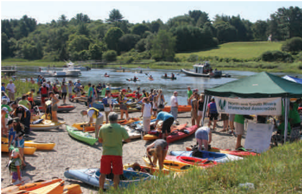
Great River Race 2014 photos by Lynn Wilson.