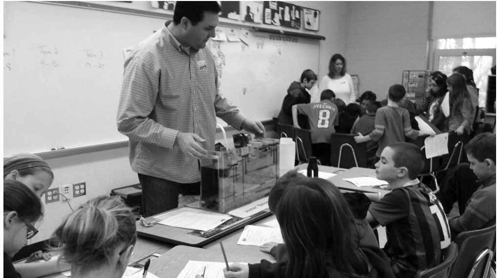
Students and parents learn about groundwater in our Water All Around You program in Hingham.

We have steadily expanded the number and variety of our scenic and historic walks and paddles, and in 2012 we initiated a “River Science Exploration Fridays” - formerly known as “Science Fridays in the Shed.” Targeted to kids and families, this has been oversubscribed from the start.