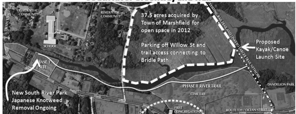
Please vote yes on April 27th at Marshfield Town Meeting for the funding to construct a kayak/canoe launch at the Keville Foot Bridge and for improving trails and parking at the Pratt parcel.

the Keville Footbridge; and public access improvements for the recently acquired Pratt parcel. As a result of the Priority Habitat Restoration status granted in 2014, Massachusetts Division of Ecological Restoration is completing a $40,000 engineering study which examines feasibility of removing Chandler’s Pond dam. The results of that study should be forthcoming in the spring. Please stay tuned to our Rivernet emails to find out when the public meeting to hear those results will be held.