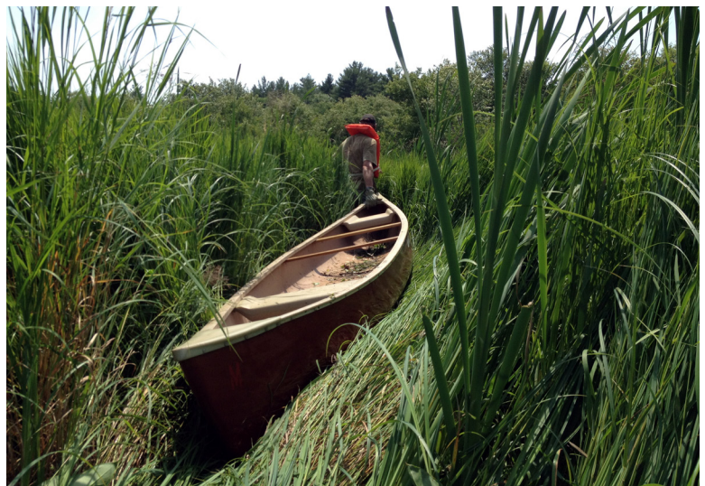
High and dry! Hauling canoes where there should be water.