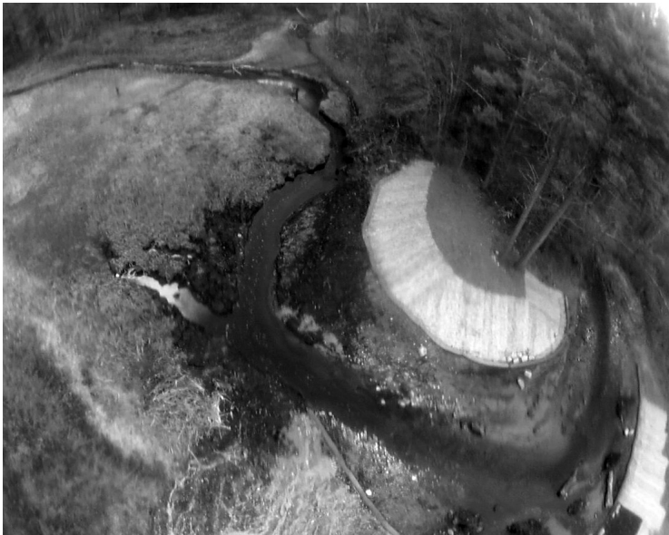
The newly formed channel on Third Herring Brook after removal of the YMCA's Mill Pond dam in October 2014.

But dam removal is only half the solution; fish passage also requires sufficient flow in the stream. So just as we worked with Scituate over the past decade to increase flows in 1st Herring Brook through a combination of water conservation and management of reservoir levels, NSRWA is pursuing a partnership with Norwell and Hanover to better manage their water withdrawals and water use to increase flows in 3HB. Norwell has applied for and just received a state grant to kick-start this partnership.