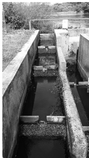
Old Oaken Bucket Fish Ladder

While continued efforts are needed to conserve water in the system, the last infrastructure work required to allow herring to return to the upper Reservoir and increase the drought resiliency of the town’s water supply is raising of the reservoir by 1.5 ft. We were extremely pleased that last fall, along with the South River funds noted above, the Environmental Bond Bill also authorized $1.3 million for this work in Scituate.