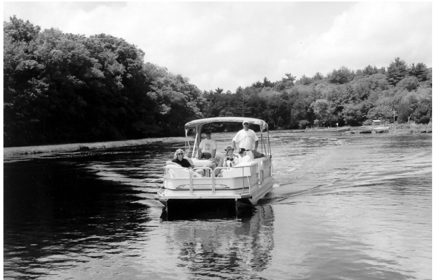
Take a tour with us on the North River this summer! See page 11.