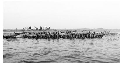
"The Emma" shipwreck at half tide.