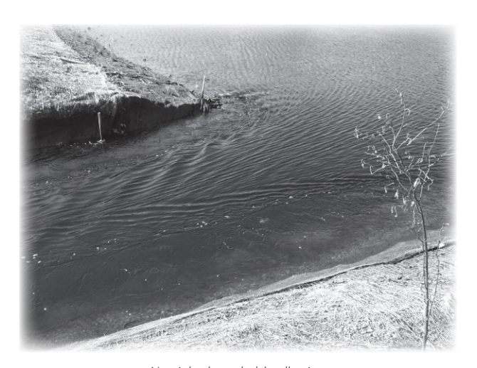
New inlet through dyke allowing tidal flooding of salt marsh plants.

NSRWA TOURS MARSHFIELD BOARDS: In our October newsletter you may have read the article on the recent water quality data we collected on the South River which identified some areas where stormwater was the water pollution culprit and some areas where wastewater seemed to be more indicated as the source. We decided more people needed to know about this (particularly those who might have the power to make a difference in remediating these pollution sources) so we went on a tour of the relevant Marshfield boards and committees. As of the writing of this newsletter we have presented the data and some potential solutions to the Planning Board (who is interested in pursuing a Stormwater Bylaw), the Conservation Commission, the Department of Public Works Commission, and the Waterways Committee. We hope to get on the agenda of the Board of Health and will present this information to the Ventress Library Trustees in mid-January. Our hope is to educate these committees about the issue and garner their support to work together to fix these problems. We have identified some grant funding for stormwater demonstration projects. We hope to partner with the town of Marshfield in applying for these funds to reach our goal to get the South River to be open for clamming in the future. We will keep you posted on our progress.