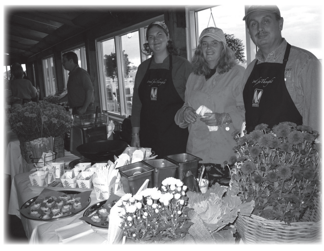
Mount Blue served three kinds of Pad Thai in mini Chinese take-out boxes.

No one could possibly have gone home hungry, because each restaurant outdid themselves in preparing generous, flavorful dishes, which truly showcased