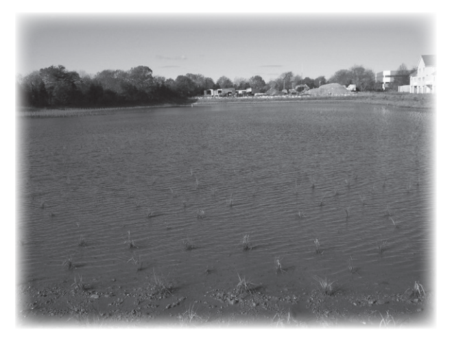
Newly planted salt marsh restoration project off the Driftway Trail at high tide.

SCITUATE SALT MARSH RESTORATION PROJECT: During construction of the MBTA's Greenbush Commuter Rail project, wetlands along the train tracks were filled in to make way for the new commuter rail. The wetlands permitting required that restoration of wetlands be part of the mitigation for the loss of the filled in wetlands. To meet their permitting conditions, the MBTA proposed to restore 2.84 acres of salt marsh along the Herring River in Scituate that had been lost due to previous filling. The salt marsh restoration site is located adjacent to the old railbed off the Driftway and next to the new RiverViews condominiums. The project is now mostly completed as the Herring River has been reconnected via a break in a berm to allow tidal flooding of the replanted and graded salt marsh. The new Driftway Trail in Scituate encircles the newly restored salt marsh. This new bike and walking trail can be accessed from Driftway park or along the Driftway next to the Dunkin Donuts there is another public access point.