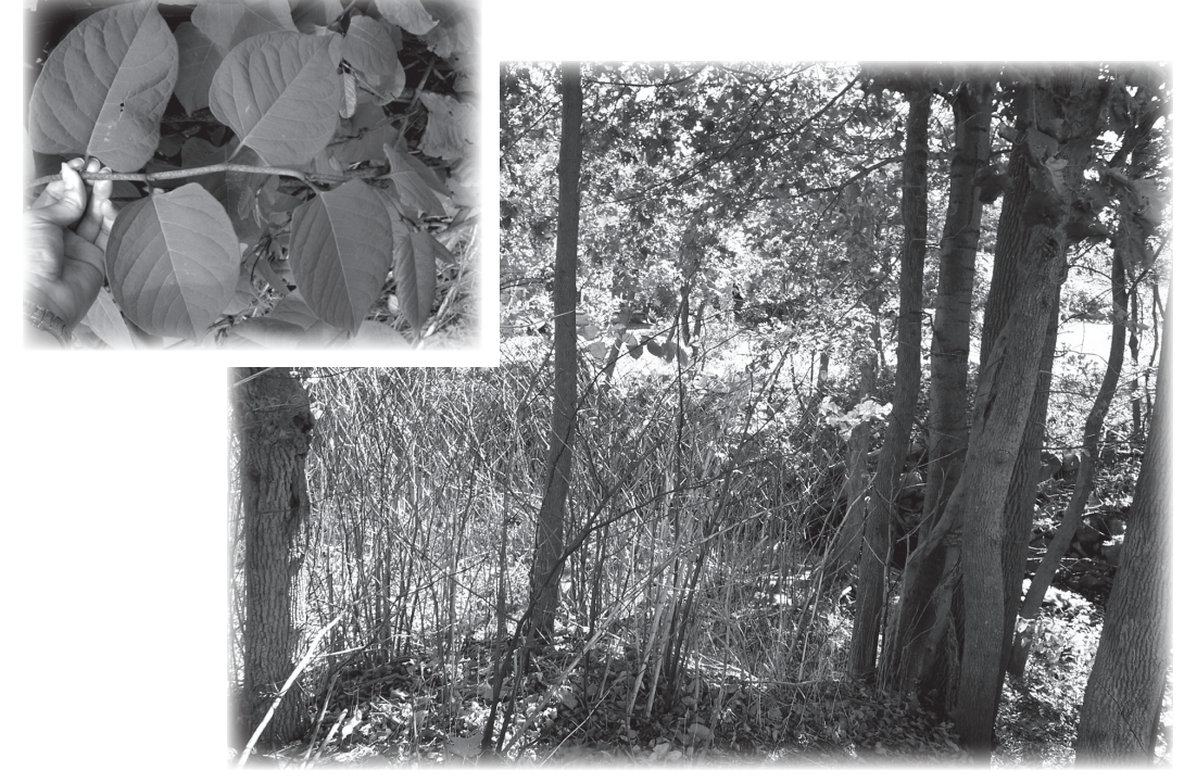
Inset: a close-up view of Japanese knotweed. Above: Dead Japanese knotweed on the banks of the First Herring Brook.