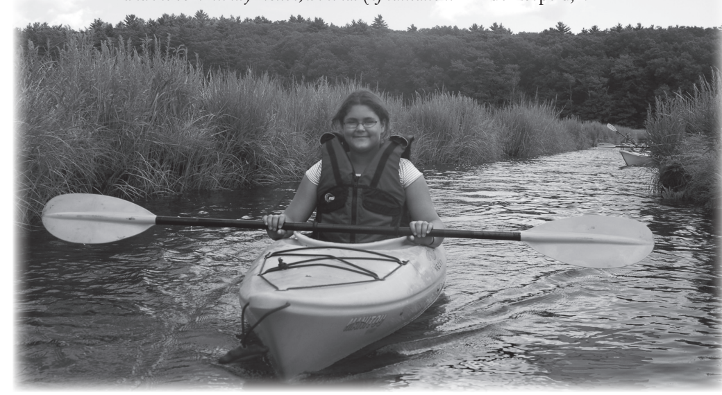
One of our 2008 River Campers.

"Acts of conservation without the requisite desires and skill are futile. To create these desires and skills, and the community motive, is the task of education." Aldo Leopold, 1944