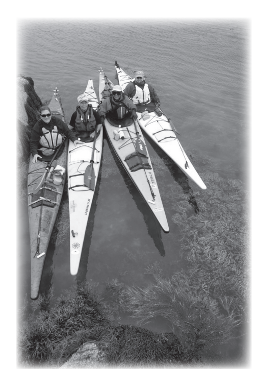
Maine Fundraiser Participants.