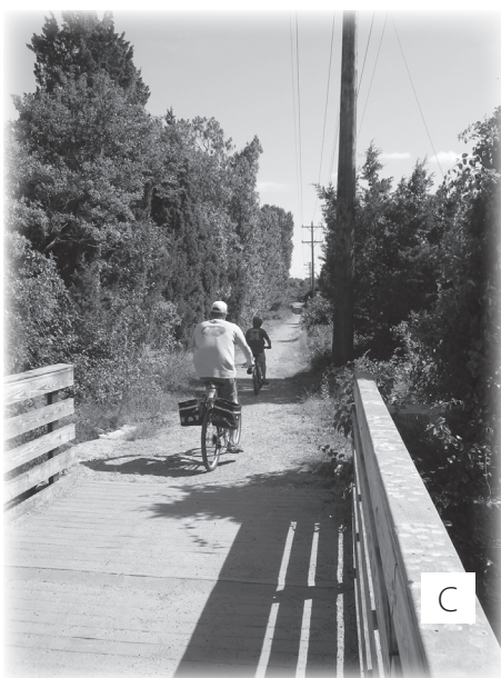
A view of the bike trail/bridle path at the Francis Keville Memorial Bridge.