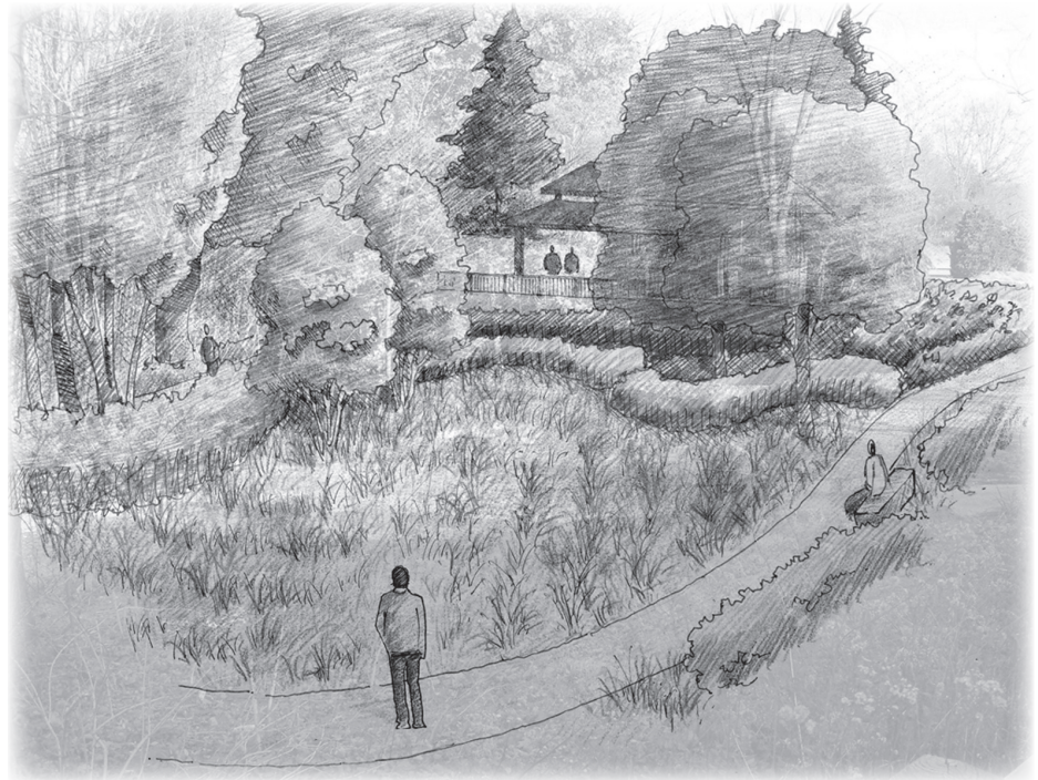
Artist's rendering of future South River Park in Marshfield.