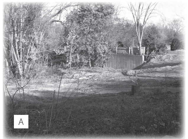
The South River Park as it looks today.