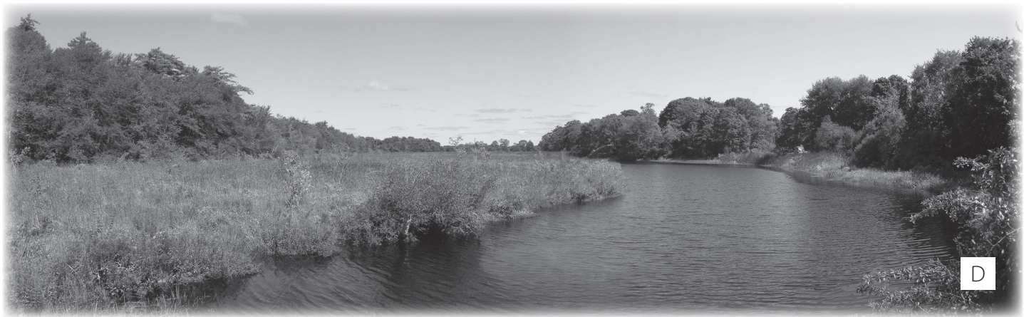
A view of the South River just downstream of the Keville Bridge.