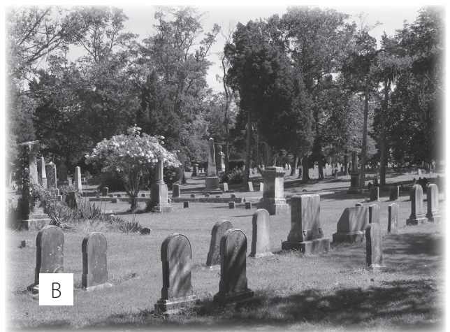
Cedar Grove Cemetery, which borders the South River.