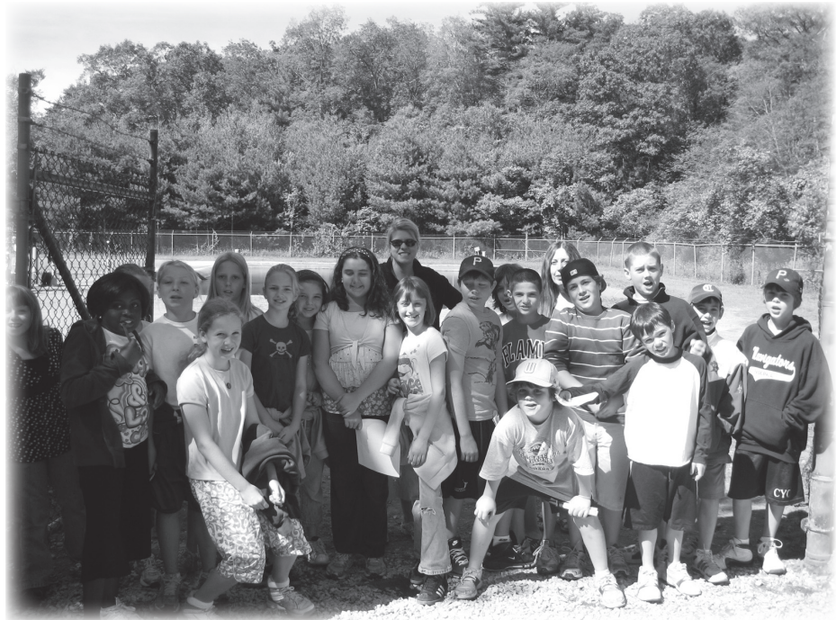
Cohasset 5th Graders on a field trip to their water supply.

B y the end of this school year 5th grade students throughout the watershed and beyond will have participated in the “Water All Around You program”. An outgrowth of our Greenscapes program--which was primarily focused on educating homeowners about water conservation--this new approach is focused on educating a different audience--our youth.