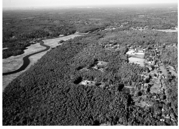
Aerial of North River with recently protected Goggin Parcel on right.

In 2005 the NSRWA charted what we wanted to accomplish through 2010 for protecting land, advancing education on river stewardship and restoring water quality and habitat. 2010 saw the culmination of many of our collective efforts - thank you! As we embark upon our next strategic planning effort, we thought it would be useful to look back at what has been accomplished over the last decade.