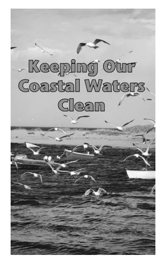
Brochure developed by the NSRWA to educate boaters on the No Discharge Area

• In 2003 the NSRWA started its Greenscapes program to educate homeowners on how to have a watershed friendly yard. Funded in partnership with the towns, we sent educational flyers to over 80,000 households for several years, hosted free workshops for homeowners, developed Greenscapes.org - and hosted a water challenge last summer to promote water conservation.