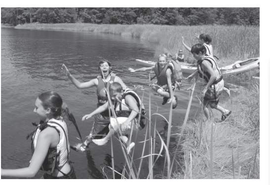
River campers enjoying a swim!

• Lastly, we have entered the schools in our watershed and beyond with our Water All Around You program. Geared towards 5th grade, this program educated 1,575 kids in 10 schools about their local water resources in 2010, with the goal of teaching them to be future stewards of their local waters. This year we will do at least that much again: our ultimate goal is to