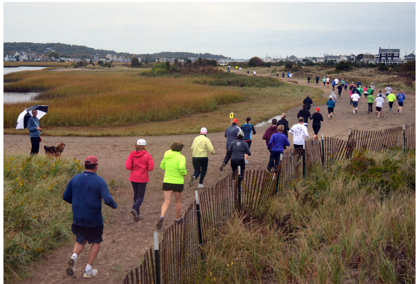
The first-ever Run for the Rivers - South River 5K.