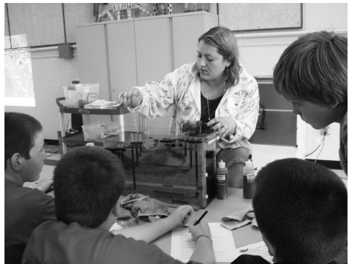
Water All Around You 5th Grade Program.