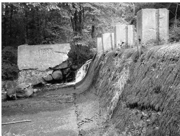
Tack Factory Pond dam - the first dam on the Third Herring Brook from the ocean.

Sign up for our e-news to be notified to pre-register for the 2013 NSRWA/YMCA River Adventures Camp and other upcoming events.