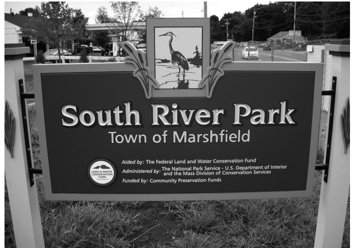
The South River Park – a piece of the South River Greenway- officially opened on October 5th!