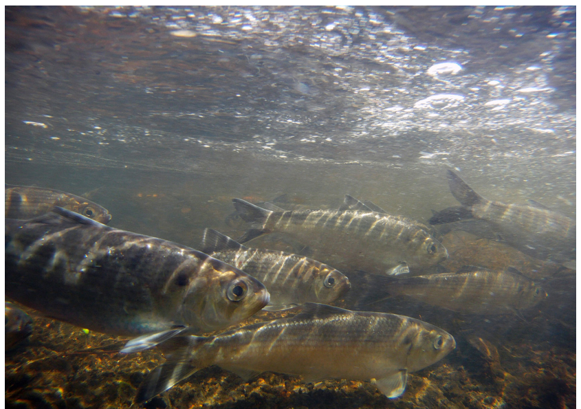
Herring return to the rivers!

We will also continue steady progress in restoring more natural flows in Third Herring Brook,