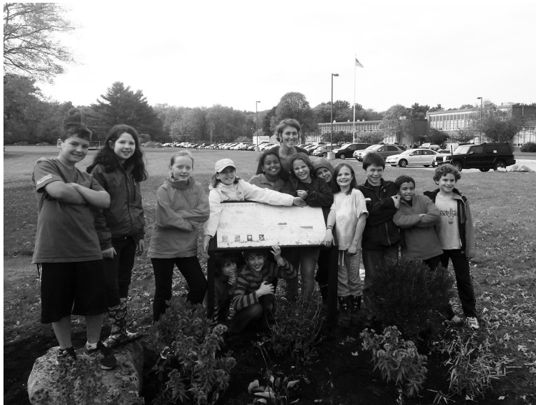
Above: Inly School Students Build a Rain Garden to treat polluted runoff. Plants generously donated by Kennedy's Country Gardens.