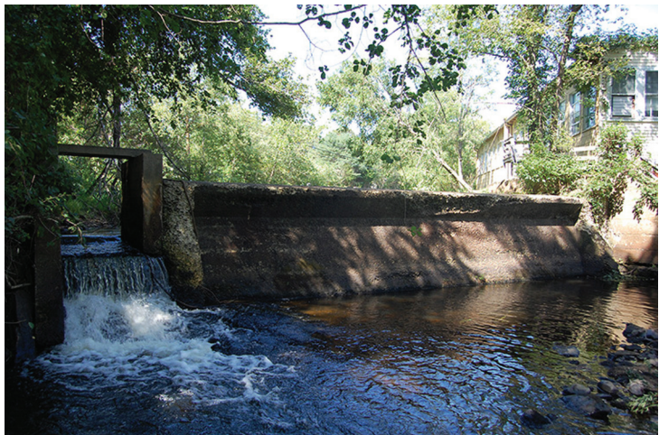
Wapping Road Dam, prior to removal.