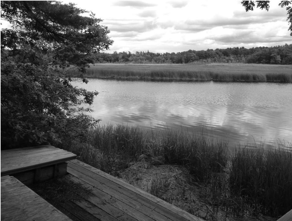
Views from Norwell property off Masthead Lane on the North River. Norwell Town Meeting votes October 7th to acquire for open space.