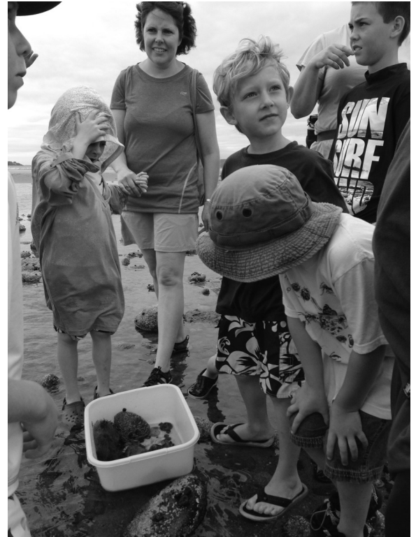
Families explore the ecology of the Spit with NSRWA scientists this summer.